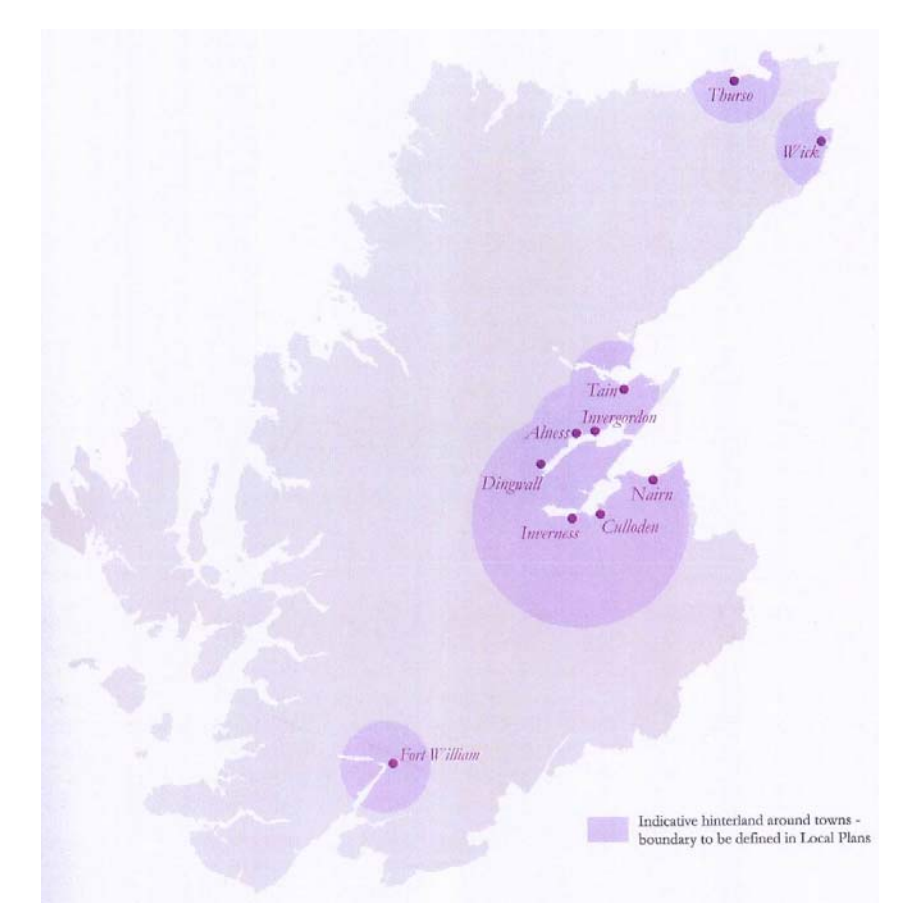
Fig. 3 : Housing in the Countryside Policy Application within the Hinterland of Towns

11. Highland Council produced a new Planning Development Policy Guideline Housing in the Countryside in March 2006 which sets out policy within and outwith the hinterland of towns. The CNPA was not consulted and has not adopted these guidelines. This document sets out the Council's approach to housing in the countryside, of which there are two strands – (a) housing in the open countryside but within the hinterland of towns; and (b) housing in the countryside in the wider rural area.