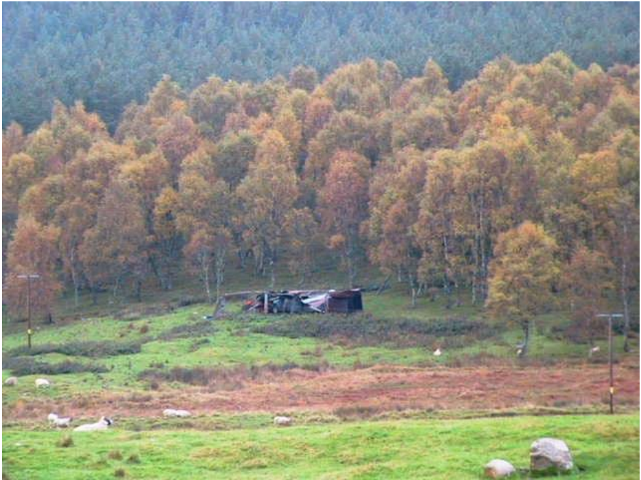
Fig. 1 : Proposed site, with remains of damaged implement shed