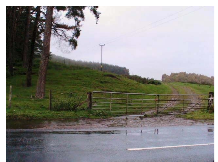
Fig. 2 : Existing farm track access off the A939 (Carrbridge – Dulnain Bridge)